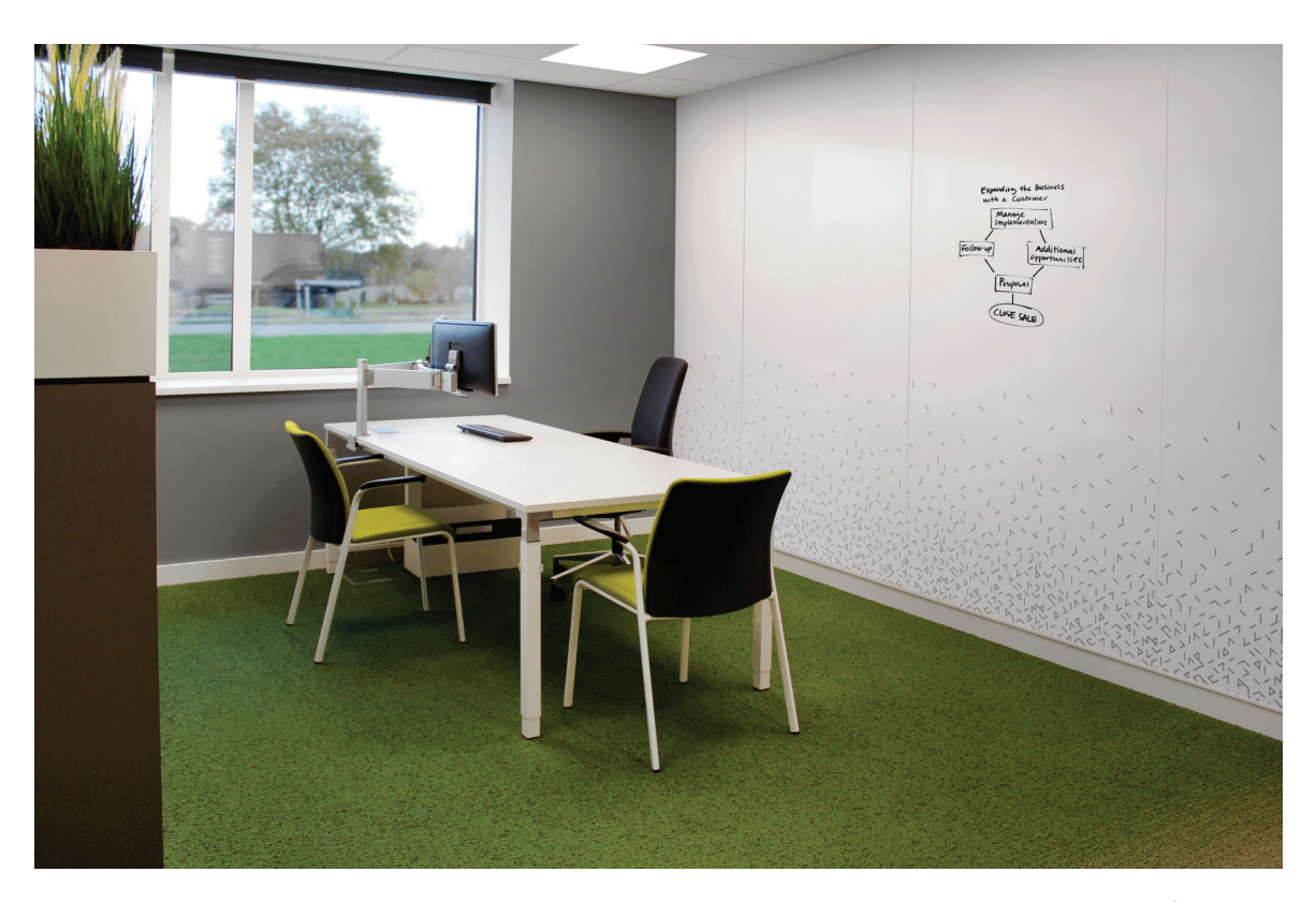
Custom Surface Imaging on White Gloss, Framed