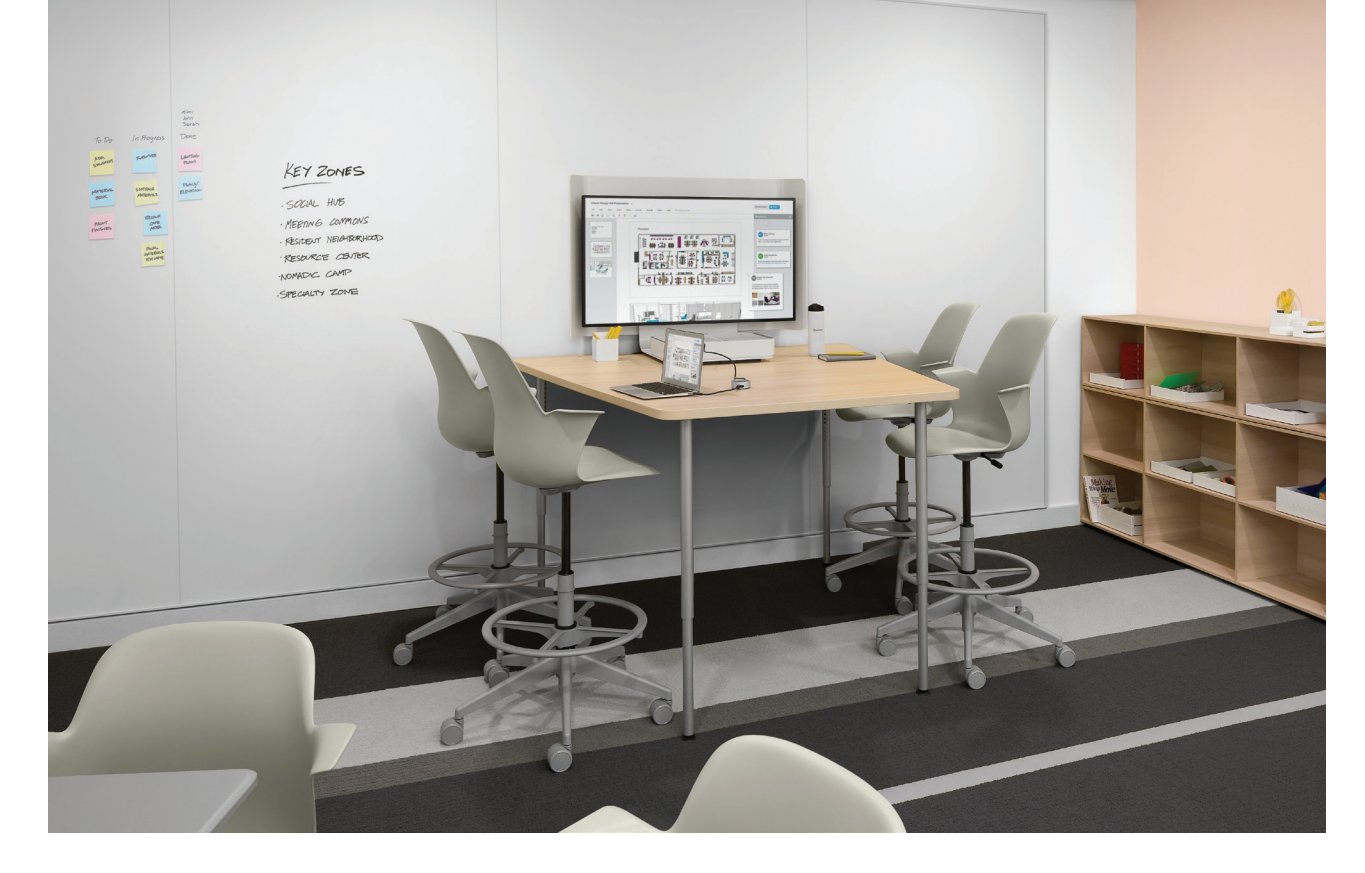
White Gloss 6100 U Framed