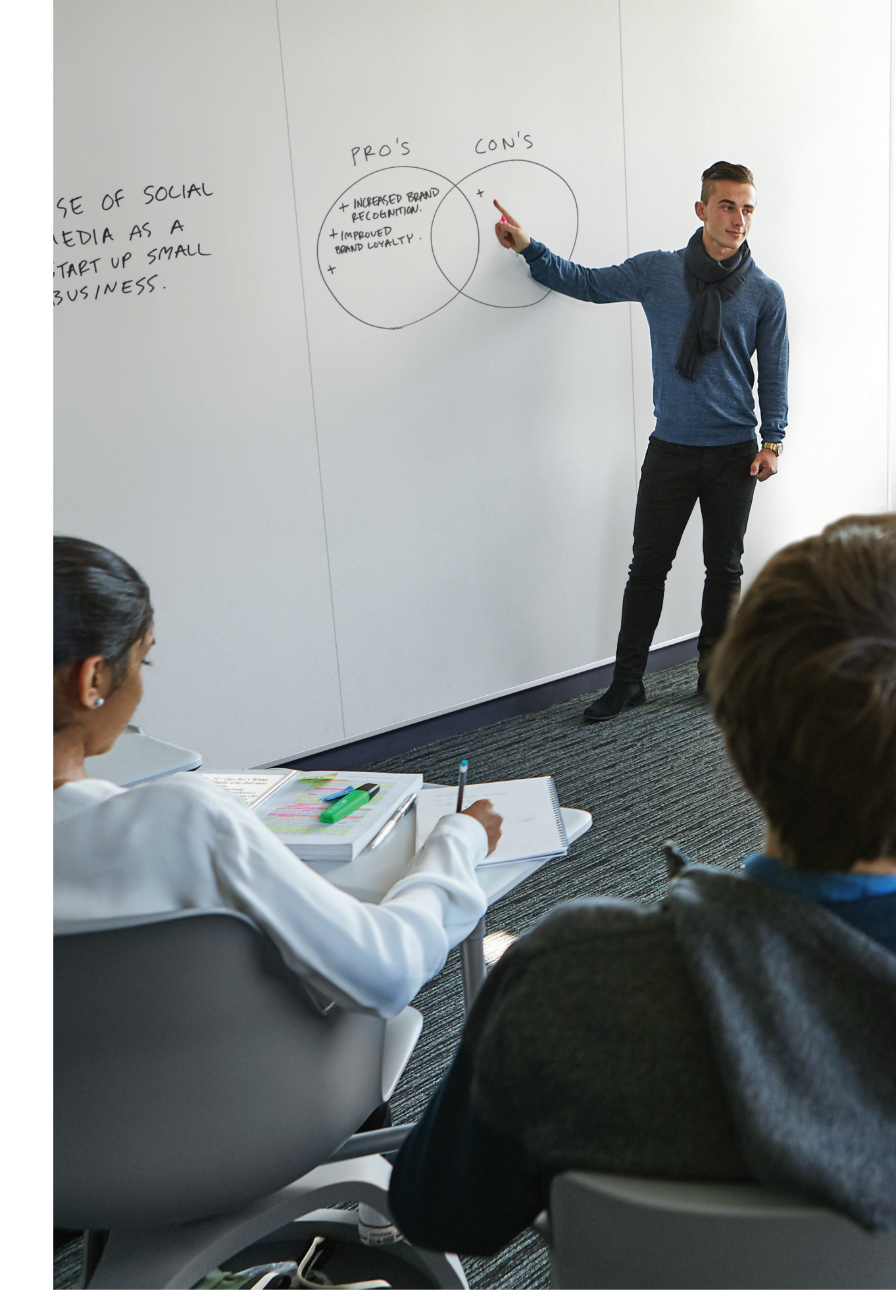
White Gloss 6100 U Framed

With a clear marker-to-whiteboard color contrast, a³ CeramicSteel offers readability not found with other surfaces. It's also magnetic, easy to clean and fully scratch resistant. In fact, it's so durable it has an expected life cycle exceeding 50 years.